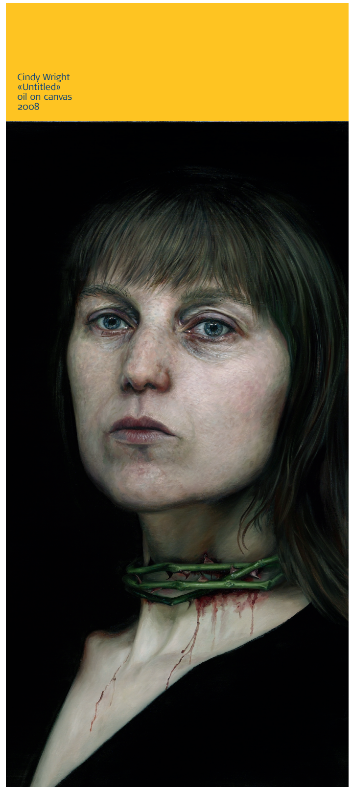
Cindy Wright «Untitled» oil on canvas 2008