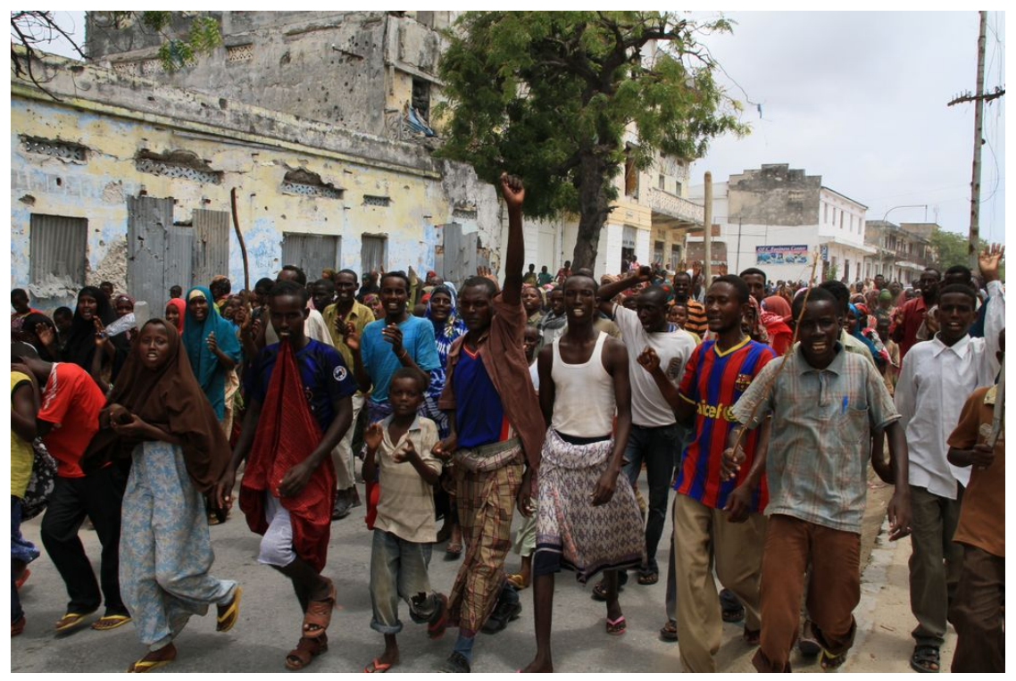
Large crowds of IDPs demonstrate in central Mogadishu against the diversion of food assistance. IDPs have held several demonstrations since the influx into Mogadishu in mid-2011. The government has not been responsive to their complaints, and in some instances has detained protesters.

Restrictions were also placed on external actors seeking direct access to the IDPs. Nongovernmental organizations described having to get the permission of gatekeepers in order to access the IDP camps. One UN staff member described with frustration how "everywhere you go, the gatekeeper will be there. We have tried to use distraction methods by splitting into groups so that the gatekeeper cannot follow us."<sup>165</sup>