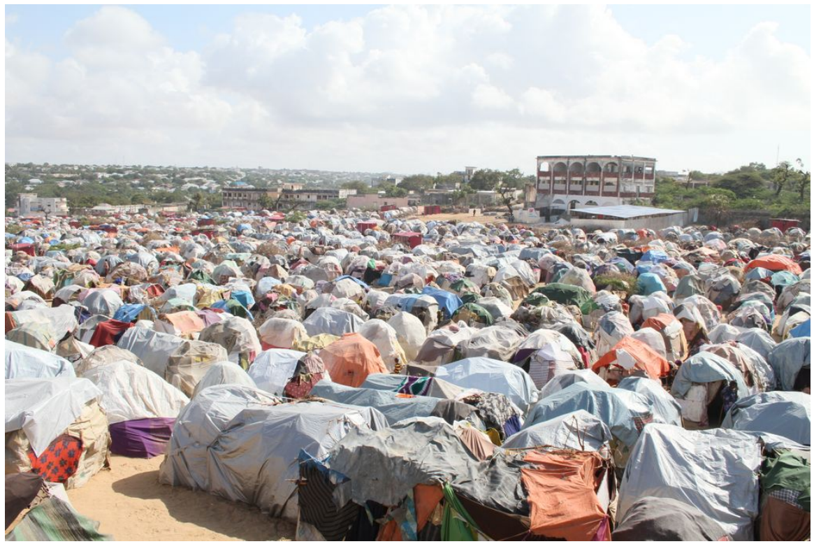
Sayidka (or Beerta Darwiishta) camp is the biggest IDP camp in Mogadishu's Wardhigley district. A week after this photo was taken in September 2011, government-affiliated militias fired into the air and forcibly looted food aid from the camp. Despite the camp's close proximity to the presidential palace, government forces did not intervene.

While more frequent in the initial phases of the 2011 influx, reports of looting continue.