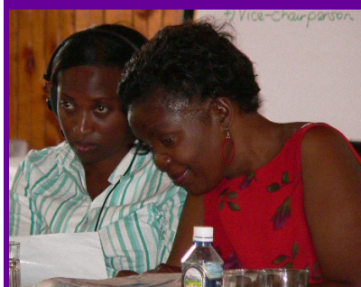
Women participate in workshops organized by the Great Lakes Institute on Women Building Peace and Good Neighborliness in September 2006.

[MP] House of Commons Ottawa, Ontario K1A 0A6