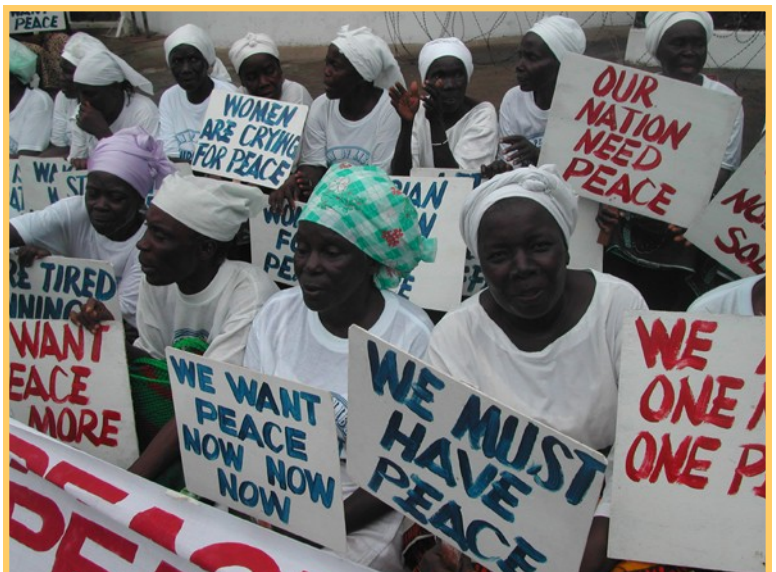
Liberian women demonstrate at the American Embassy in Monrovia at the height of the civil war in July 2003. (Pewee Flomoku)