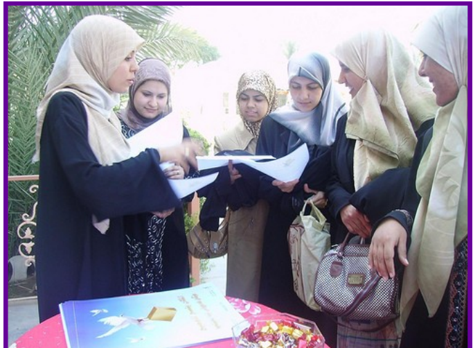
Iraqi women from the La'Onf Nonviolence Group pass out nonviolence materials to students at the College of Education for Girls in Najaf.

These policy recommendations and the preceding background information are important to include when writing to or speaking with government representatives. Many MPs are not specialists in the realm of gender or security; clear, detailed suggestions with background help them to make decisions and bolster the case for urgent action.