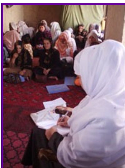
Women in Afghanistan discuss peace and conflict.

Tip: Not sure who your MP is? Find out online at www.parl.gc.ca where you can input your postal code to find your MP's contact information.