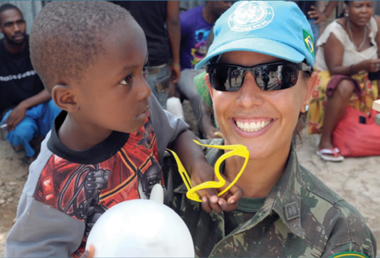
Brazilian female peacekeeper in Haiti