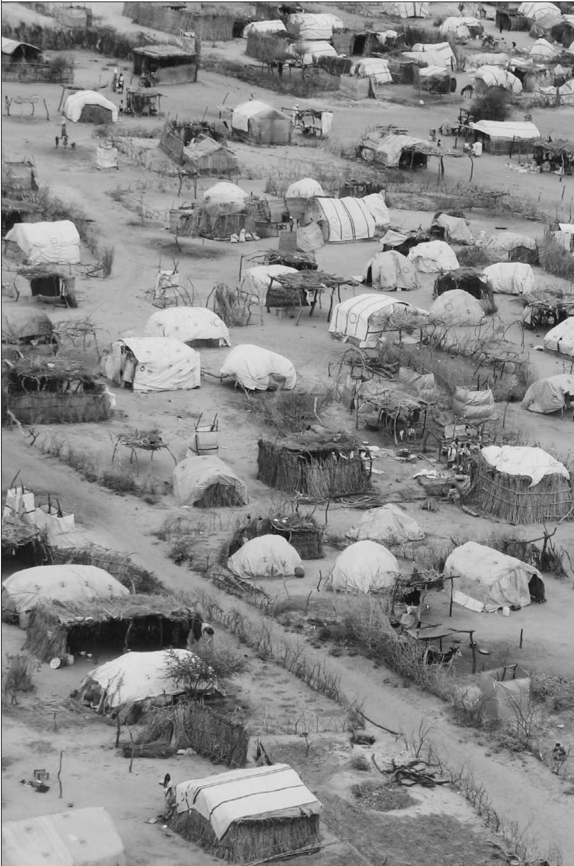
An aerial view of Gereida camp in South Darfur shows a few of the makeshift dwellings that house some 128,000 people. A few months after this photo was taken in 2006, attacks forced international aid agencies to suspend their operations here.