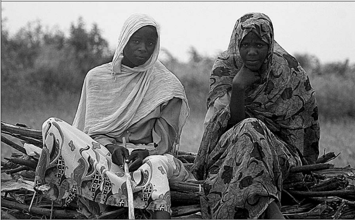
Two women return home after collecting firewood for their cookstoves. When women and girls leave the camps for such forays, they are frequently targets for rape.