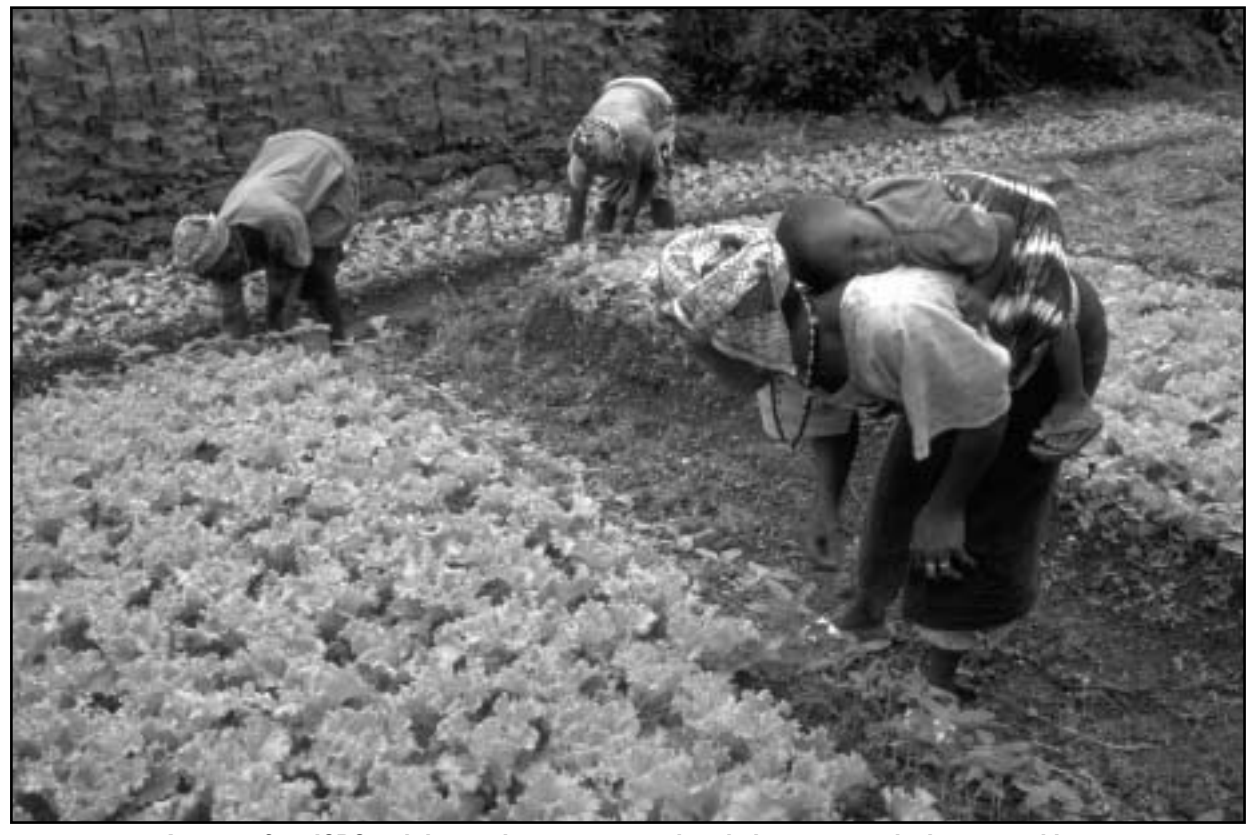
As part of an ICRC training project women tend to their crops, producing vegetables that provide a stimulus for the local economy and contribute towards self-sufficiency

women in the techniques of seed multiplication (replicating seeds for the continued sowing of further crops), and to address, in an integrated fashion, the women's needs in terms of training and materials for vegetable growing. These programmes offered women affected by the conflict two basic benefits. Firstly, community-based vegetable seed support. During 2000-2001, through a total of 917 co-operative associations 71,442 women received vegetable seeds and tools, to restore and enhance their traditional economic activity. Secondly, training was necessary to maintain self-sufficiency. Representatives of each of the women's associations were trained in vegetable growing and seed multiplication techniques through one-week workshops. Then, during 2002, 415 women's associations in eastern Sierra Leone were assisted with the same programmes, through the joint efforts of the ICRC, the Sierra Leone Red Cross Society and the Ministry of Agricultural.