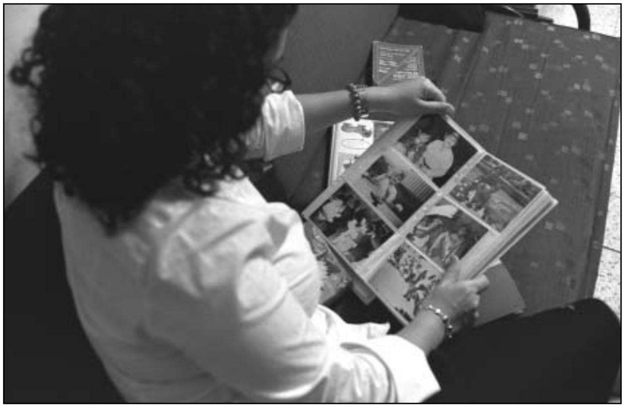
A young woman, anxious for news of her missing brother, a captured soldier, looks through a family photo album for comfort