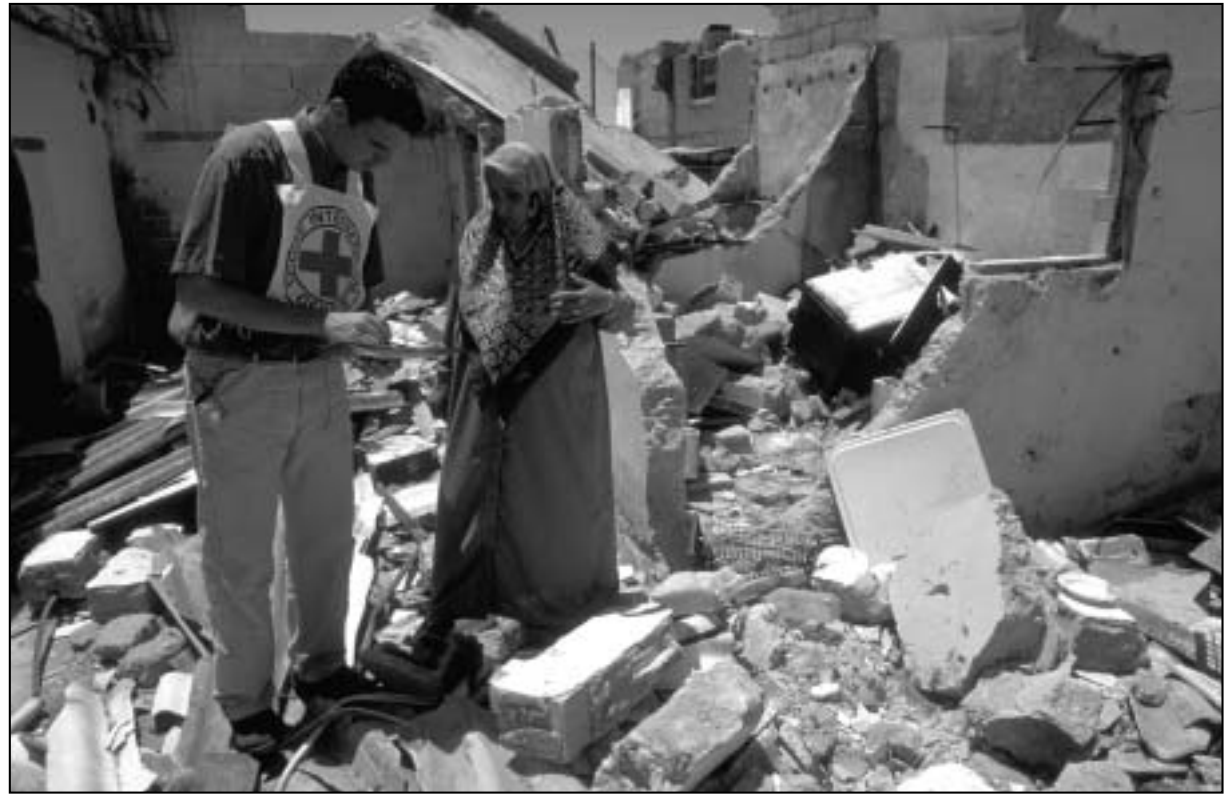
A woman talks with an ICRC delegate, surrounded by the rubble of her destroyed house

A series of fact sheets, posters and videos has also been produced highlighting the various ways in which women are affected by armed conflict, promoting the relevant rules of war pertinent to women, including the prohibition of sexual violence. Additionally, a series of audiovisual communication tools (see Annex) was produced at both the ICRC headquarters and in its delegations in the field promoting and raising awareness of the impact that war has on women. Specifically tailored awareness campaigns have been conducted through many ICRC delegations, including the regional delegations of Dakar, Pretoria, Yaoundé, Nigeria, Buenos Aires and Moscow.