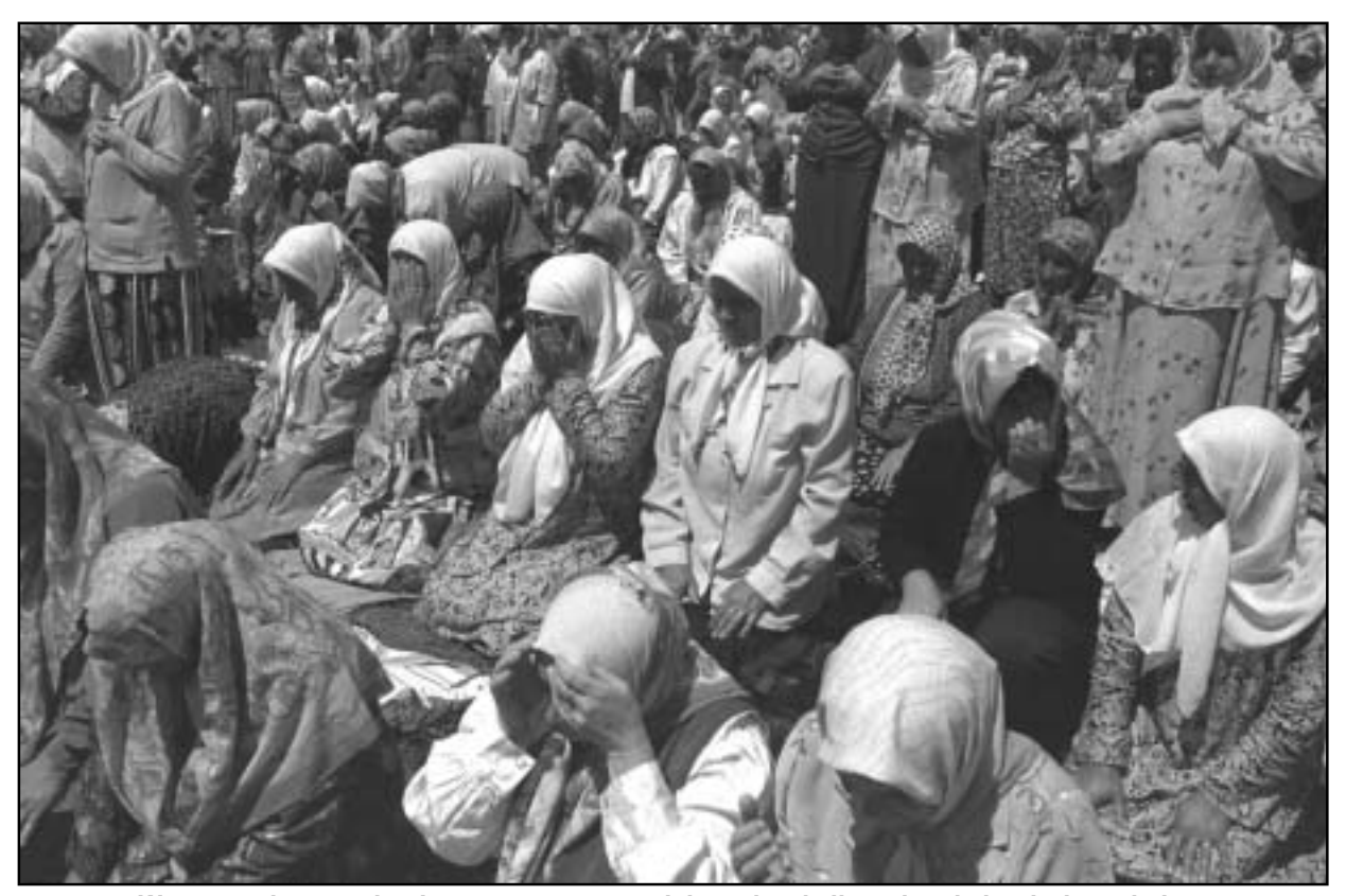
Women gather together in prayer at a memorial service dedicated to their missing relatives

part in hostilities must be better disseminated to all parties to an armed conflict, armed forces, security forces and police forces. This law needs to be better understood, enforced and respected. In addition to trying to prevent sexual violence, more needs to be done to assist and support those who are victims of such violations.