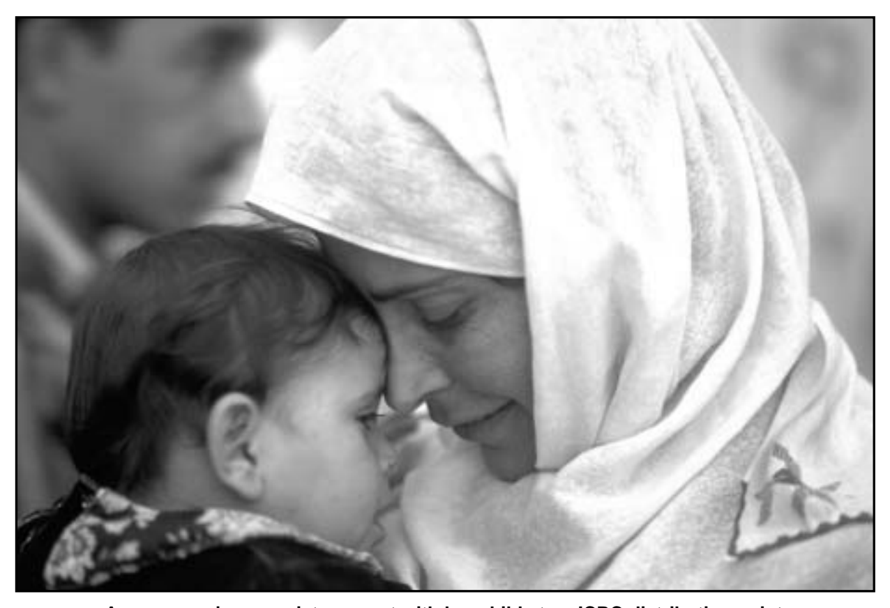
A woman enjoys a quiet moment with her child at an ICRC distribution point

The vulnerability of different groups - whether male, female, elderly or infant - will differ, according to their exposure to a given problem, their capacity to deal with it and its impact on the group concerned. Vulnerability, as such, does not fit into an easily determined category or definition - especially where women are concerned. It is therefore in accordance with the specific nature of each situation and the different factors involved that groups of women could be identified as being particularly at risk and in need of special assistance, e.g. pregnant women, nursing mothers, widows, mothers of small children or female heads of household.