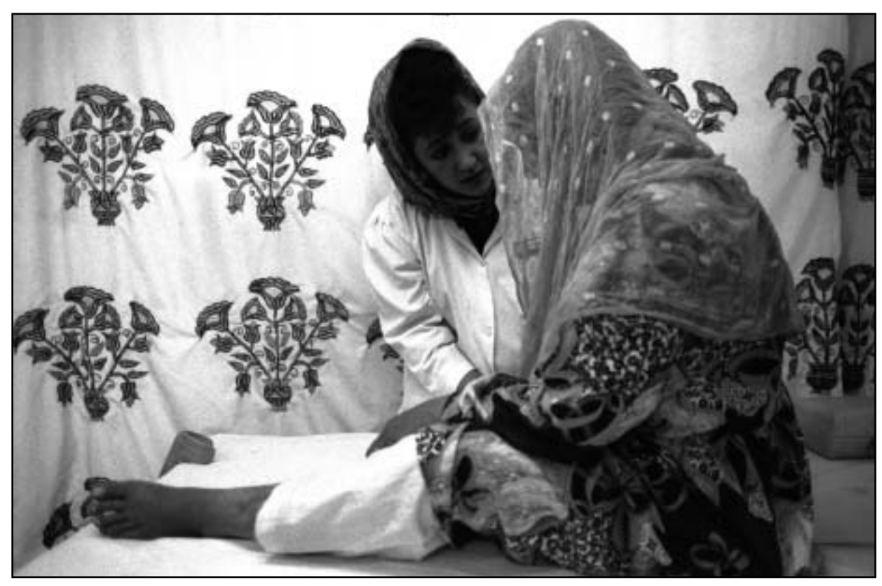
A physiotherapist helps a mine victim to regain her mobility at an ICRC orthopaedic centre