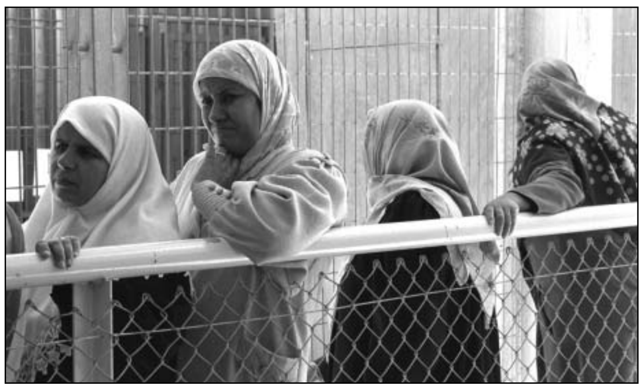
Women queue patiently during a family visit to a prison

In particular, the ICRC actively assesses the conditions of detention of women in respect to international standards of human rights and international humanitarian law. Specifically, the ICRC tries to ensure: