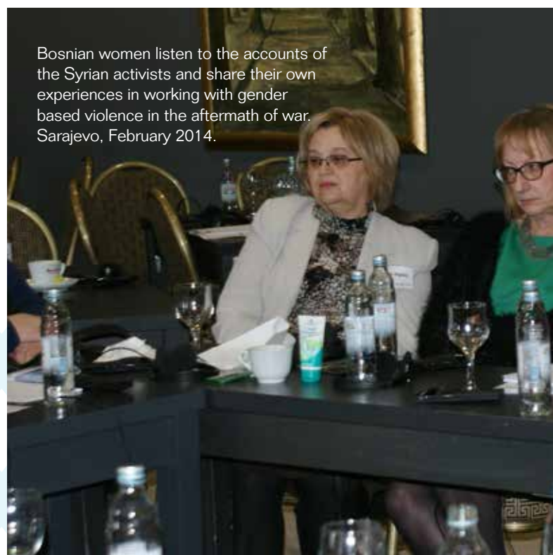
Bosnian women listen to the accounts of the Syrian activists and share their own experiences in working with gender based violence in the aftermath of war. Sarajevo, February 2014.

The Syrian regime has used siege as a strategy to apply pressure on opposition dominated areas. Entire cities and neighbourhoods have been suffering a complete block of food, medical supplies and resources for long periods of time, amounting to years in some of the cases. This has a disproportionate impact on women, as they are the first to lose their basic rights, including the right to movement, food and education. The escalation of violence and the lack of rule of law associated power and empowerment with arms that are not available to women. Moreover, women bear a new role, heading households in addition to their traditional tasks.