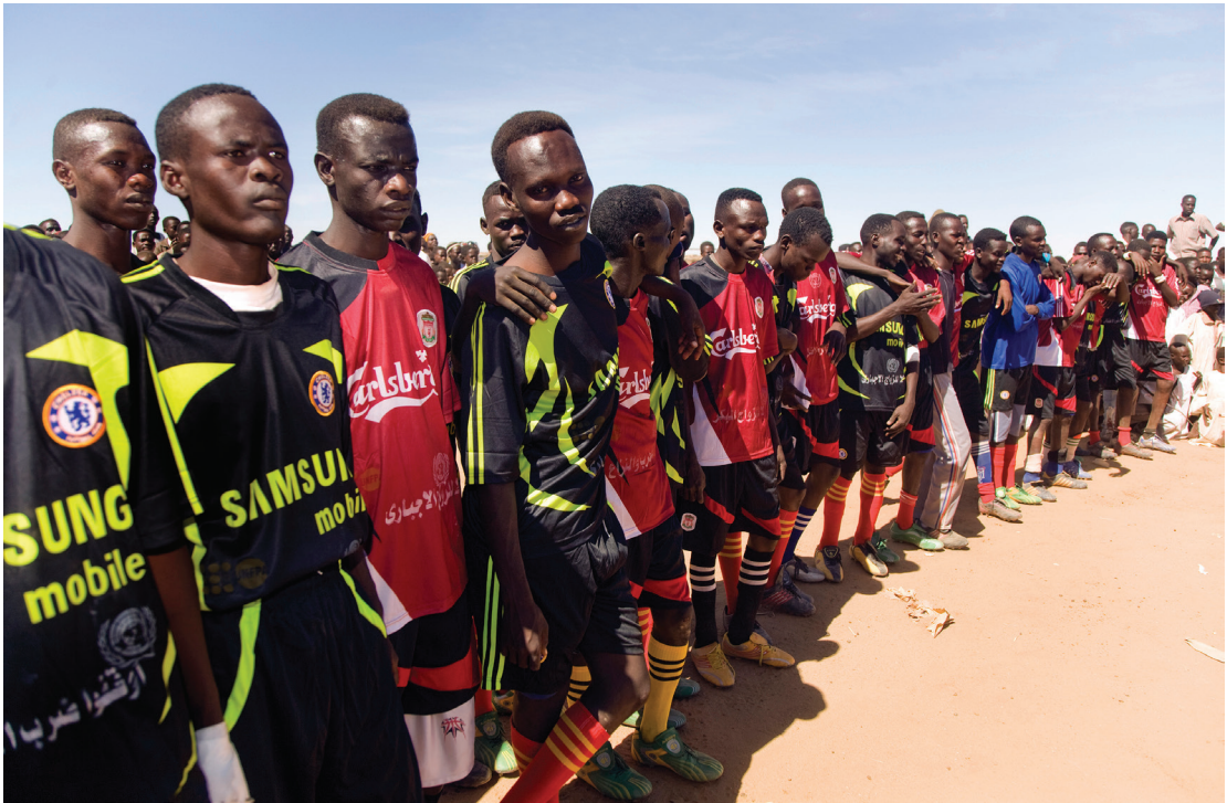
Sudanese football teams play football as part of campaign 'We Can End Violence Against Women', organised by African Union-United Nations Hybrid Operation in Darfur (UNAMID) and the United Nations Population Fund (UNFPA), Abu Shouk Internally Displaced Persons Camp, North Darfur, 2009.