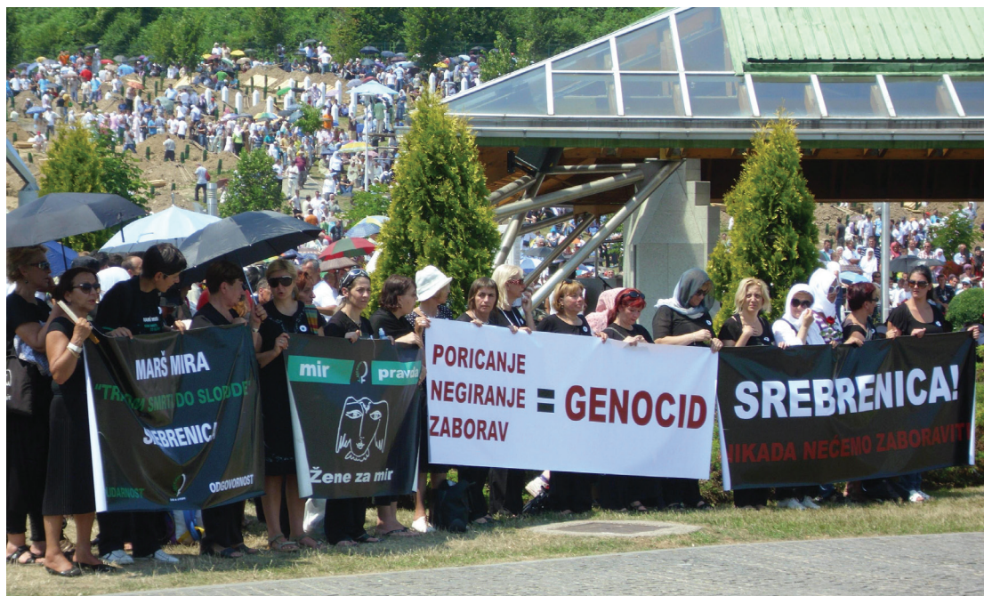
Members of Women in Black, a peace and justice organization, attend a memorial service, held every year in Srebrenica, Bosnia-Herzegovina, July 2011.