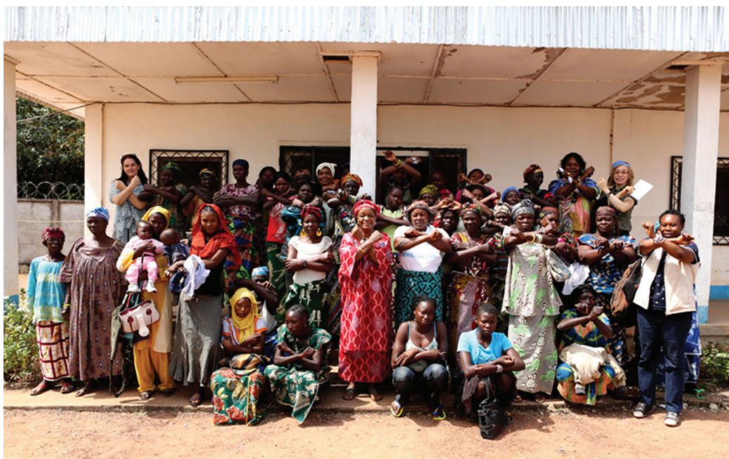
A women’s group in Central African Republic joins UN Special Representative on Sexual Violence in Conflict, Zainab Hawa Bangura, in the ‘stop rape in war’ campaign.