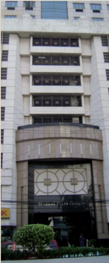
HD Centre office in Manila, Philippines.

In 2010, the HD Centre continued to play a key role in the GRP-MILF peace process with its involvement both in the International Contact Group, assisting the GRP Peace Panel's consultation process with Local Government Unit chief executives in Mindanao and with the various activities of the Mindanao Think Tank Project.