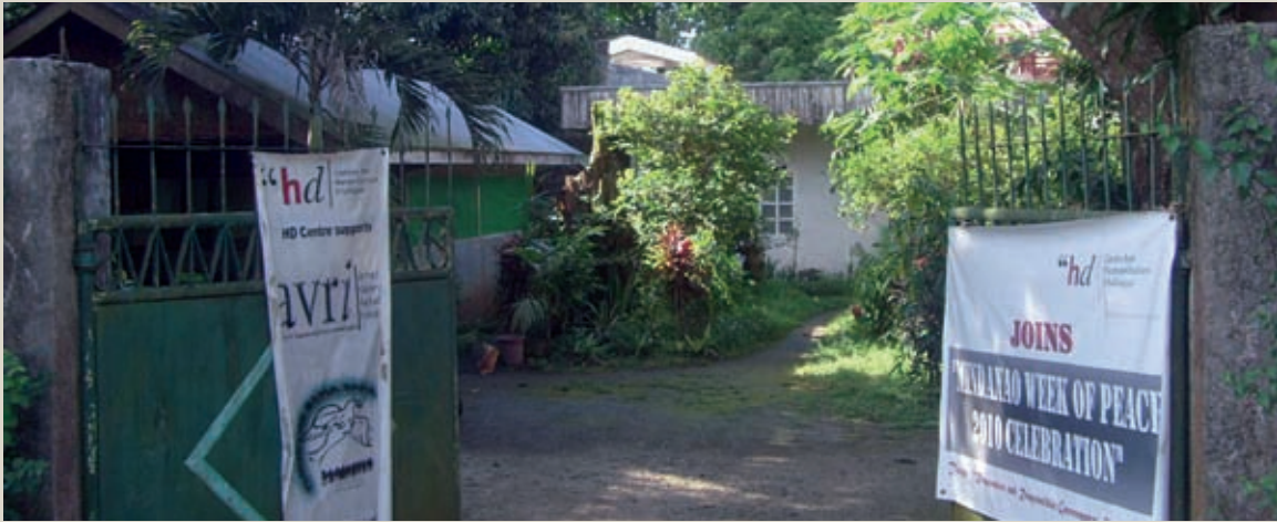
HD Centre office in Sulu, Mindanao.

The support of the HD Centre to the Tumikang Sama-Sama, to the Armed Violence Reduction Initiative (AVRI) and to Preventing Election Related Violence (PERV) volunteers has paved the way to enriching the lives and security of Tausugs in their undying quest for peace.