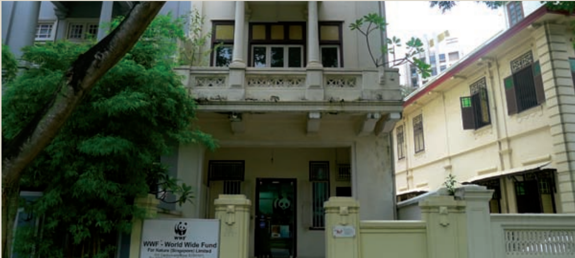
Asia Regional Office, Singapore.

Geographically and culturally straddling South Asia and South East Asia, Singapore is an ideal location for the HD Centre's regional office to be located. With a thriving policy community driven by a multitude of think-tanks and research institutes, Singapore also provides the HD Centre with the opportunity to reach out to eminent analysts and leading experts of relevance to its projects, particularly the Association of Southeast Asian Nations (ASEAN).