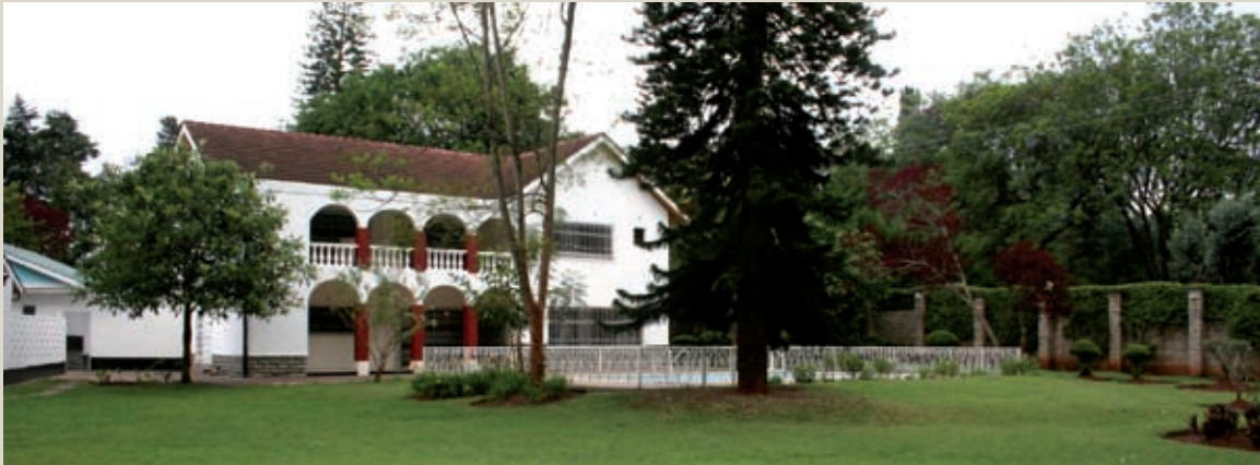
Africa Regional Office, Nairobi, Kenya.

Where we work in Kenya, the approval by the population of a new constitution and the joint commitment to this by the President and Prime Minister has brought hope to an expectant nation. In neighbouring Sudan, preparations for the southern Sudan referendum – an event of historic proportions – were watched closely. At the same time, conflicts continued to linger in some parts of the continent such as in neighbouring Somalia, making progress difficult on improving civilian protection and attaining regional peace.