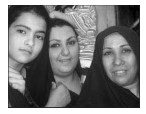
Women and girls in Baghdad

Women also contributed to Iraq's civil society. In 1952, the Iraqi Women's League (IWL) was founded to defend the rights of women and children. And after 1958 the Kurdish Women's Federation (KWF) began to link women to the national independence movement, which called for democracy, autonomy for Kurdistan, and an end to British rule. Together the organizations promoted women's political participation, social and economic rights, and combated