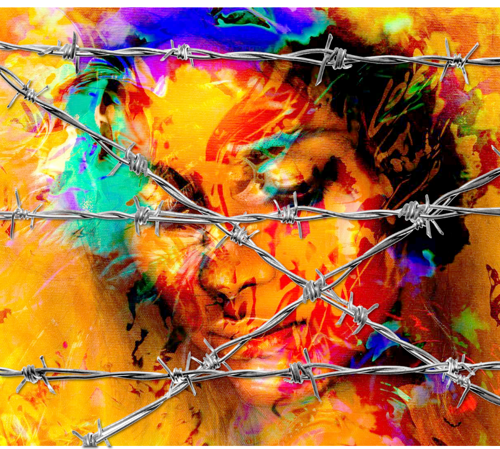
Economic and Social Commission for Western Asia