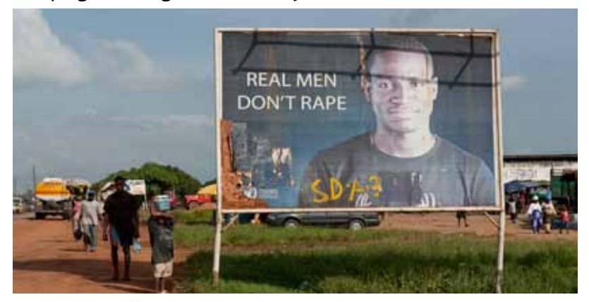
Billboard used during the nationwide Anti-Rape Campaign

UNMIL, through the Joint Government/UN Program on SGBV, has introduced two major sensitization campaigns: the Campaign against Sexual Exploitation and Abuse (2006-2008); and the Anti-Rape Campaign (2007-2008). These campaigns served as the primary vehicle for organizing, developing and disseminating important messages about the rights of women and girls in Liberian society, and constitute the first best practice. Partners have cited the campaigns as key to addressing SGBV through improved knowledge and information sharing, while women in the community mentioned the importance of campaign messages consistently.