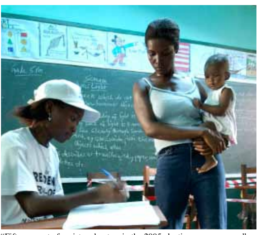
"Fifty percent of registered voters in the 2005 elections were women"

National and international NGOs decided that the MoGD was the appropriate mechanism for carrying civic out and voter education campaigns. Empowered by early support and attention by the OGA, women's NGOs were assigned