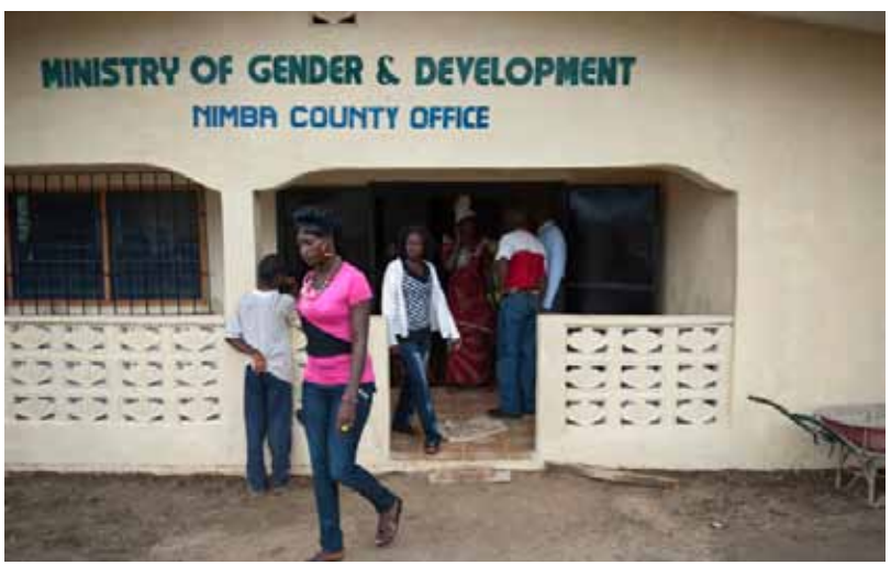
"The Ministry of Gender plays a key role in supporting gender mainstreaming and women's empowerment in the 15 counties"

enable women throughout the country for participation in the policy-making processes. The Poverty Reduction Strategy (PRS), the Liberian National Action Plan on 1325 (LNAP), the National Gender Policy, and the Truth and Reconciliation process have been influcenced by women's voices and concerns.