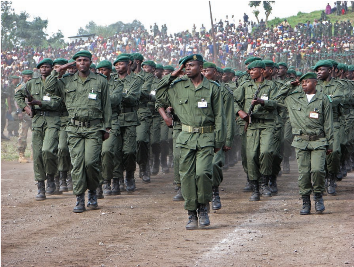
Soldiers of the then-newly integrated 14th Brigade of the FARDC at their unit's passing-out parade at the Rumangabo military base in North Kivu on September 15, 2006. Human Rights Watch does not intend or make any representation that the soldiers depicted in the above photo are responsible for the crimes discussed in this report.