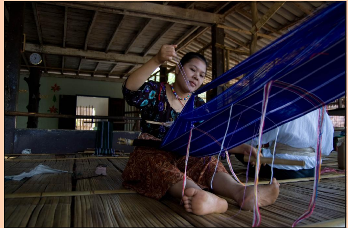
Huay Malai Safe House weaving center improves women's livelihoods

In the past, most of the HIV/AIDS patients that came to the clinic were men but now the clinic is admitting