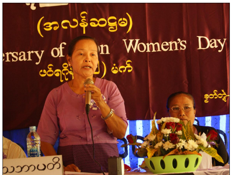
Female community leader gives speech at MWD

Under the rule of the Burmese military regime women are not assured their basic rights. Women are physically and psychologically abused daily and violence in ethnic states and the use of women as weapons of