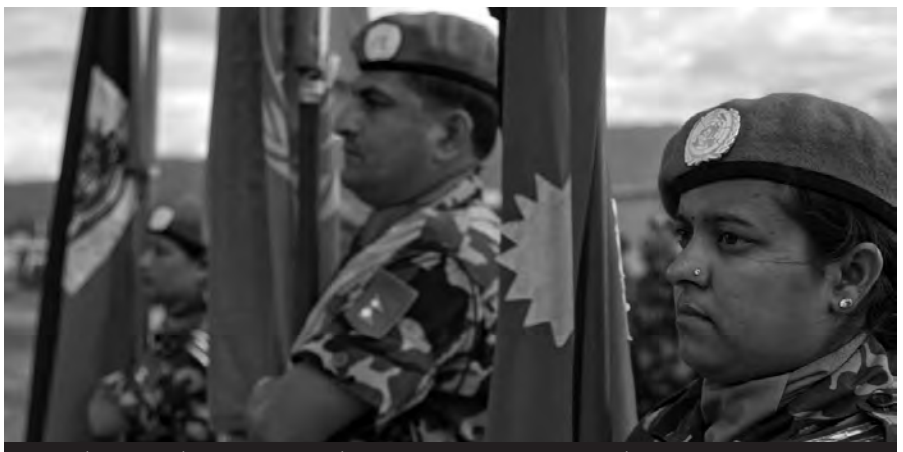
▲ Nepalese peacekeepers on parade. Port-au-Prince, Haiti. March 2009.

Operational advice to Member States should also stress the importance of nominating a dedicated gender focal point within every military contingent, with clear terms of reference. The military gender focal point would provide ongoing advice to contingent commanders on how a gender perspective can enhance the efficiency and effectiveness of the contingent's operational tasks, and would offer targeted in-mission gender training to members of the contingent. The gender focal points would serve as principal points of liaison between the contingent and the peacekeeping mission's Office of the Gender Adviser.