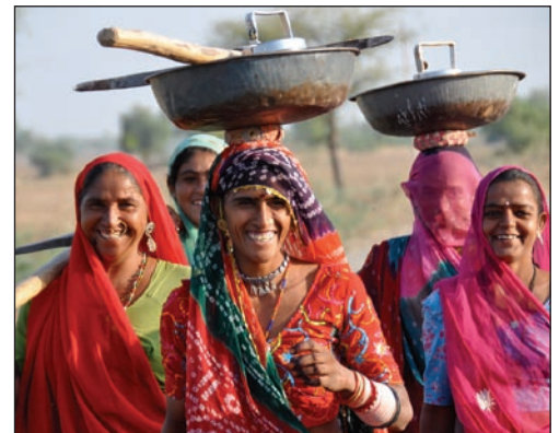
Involving women in social protection schemes is one step, but changing gender dynamics is harder

Scholarship on the welfare state in developing countries has long recognised the importance of the politics behind redistribution (Esping-Andersen, 1990; Rueschemeyer et al., 1992). Until recently, however, discussion about social