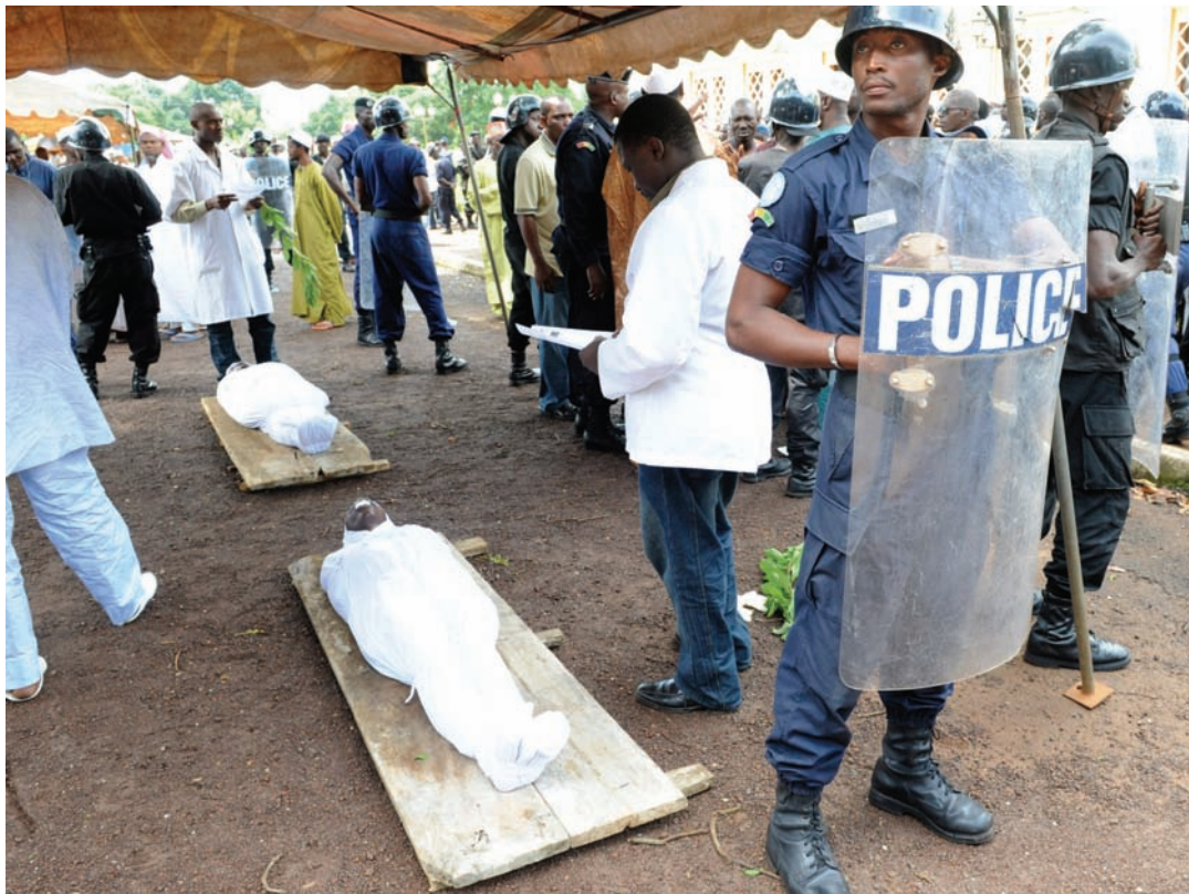
A policeman stands next to the bodies of people shot dead by Guinea junta forces on September 28, 2009 in front of the Conakry great mosque.

On April 1, 2011, following a visit to Guinea, Bâ Amady, head of international cooperation in the ICC's Office of the Prosecutor, issued a declaration recognizing the cooperation of the Guinean authorities and the new government's commitment to bringing perpetrators to justice. However, he urged the government to increase accountability efforts and reiterated the ICC's responsibility to take action if the government fails to do so promptly and adequately. 47