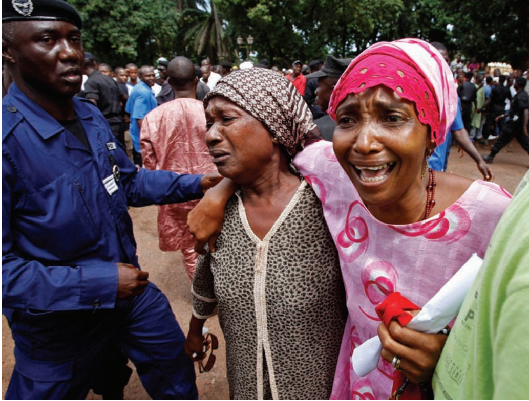
Women at Conakry's great mosque react as they look for the bodies of family members and friends that were killed during a rally on September 28, 2009.

At the time of writing there has been scant information regarding progress on the investigation and no evidence of government efforts to locate the over 100 bodies believed to have been disposed of secretly by the security forces. Unfortunately, the military hierarchy failed to put on administrative leave, pending investigation, soldiers and officers known to have taken part in the September 2009 violence. Human Rights Watch is also concerned about President Condé's appointment of two individuals implicated in the September 2009 violence into government positions: Lt. Colonel Claude Pivi who is the Minister of Presidential Security ( Ministre chargé de la sécurité présidentielle ) and Lt. Colonel Moussa Tiégboro Camara who serves as Director of the National Agency against Drugs, Organized Crime, and Terrorism ( Directeur de l'Agence nationale à la présidence chargé de la lutte contre la drogue, les crimes organisés et le terrorisme ). 42