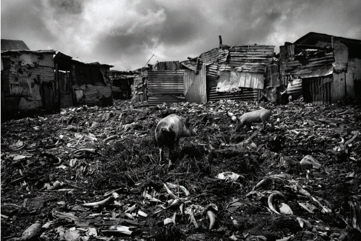
Pigs look for food in a garbage dump behind an abattoir. Despite abundant natural resources, Guinea ranks among the world's poorest countries on the United Nations Human Development Index.

Ministry of Finance personnel and high-level government officials described how senior government civil servants, including ministers, embezzled huge sums of money, sometimes instructing payers to make deposits directly into their personal bank accounts. 173 They cited incidents that they alleged demonstrated falsification of receipts, ghost workers on the public payroll, and widespread failure by ministry officials to comply with procurement regulations. Officials from the finance and audit ministries complained that many contracts are decided without study or approval by the director of public procurement but rather, are “dished out in flagrant violation of the codes and on the basis of friendship, ethnicity, and political expediency.” 174