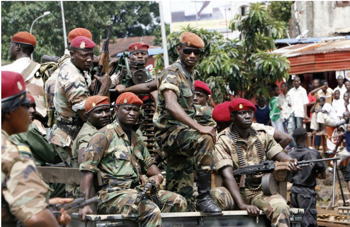
Soldiers patrol on a vehicle near the international airport in Conakry, October 05, 2009. (Guinea Military)

In 2009 ECOWAS, the UN, and the AU launched a security sector reform initiative envisioned to identify problems and recommend ways to address these problems. The effort is broadly aimed at subjecting the security services to civilian oversight, reducing the bloated numbers of the army, and ensuring fiscal transparency. Findings by the group were presented in a report to the Guinean transitional government in May 2010. The report's over 150 well-founded recommendations to professionalize the sector are meant to serve as the operational roadmap for reform.