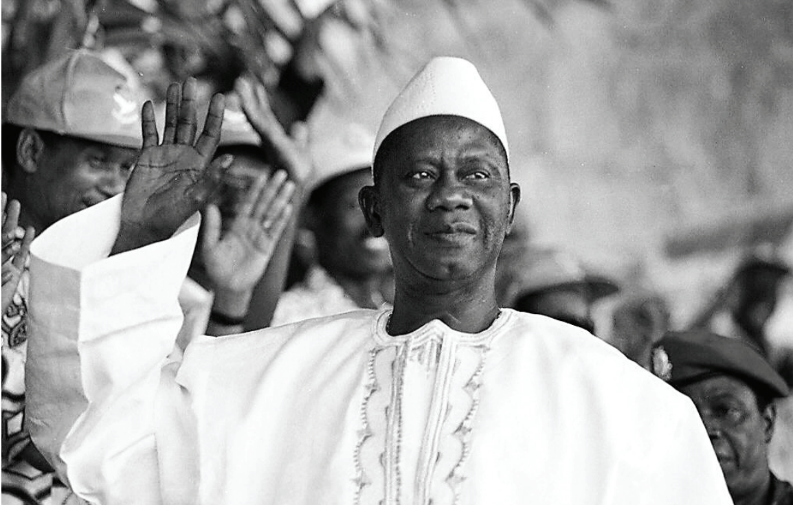
Army Colonel Lansana Conté took over in a coup d'état in 1984. Despite initial promises to ensure better respect for human rights, President Conté presided over another quarter century (1984-2008) of state-sponsored abuses and repression, albeit far less extreme than those of his predecessor.

Conté and his government also presided over an increasing criminalization of the state in which members of the ruling party, his family, and security forces engaged in frequent criminal acts ranging from theft and embezzlement to drug trafficking. 19 By the end of Conté's regime, Guinea had become a major transit hub in West Africa for narcotics being trafficked from South America to Europe. 20