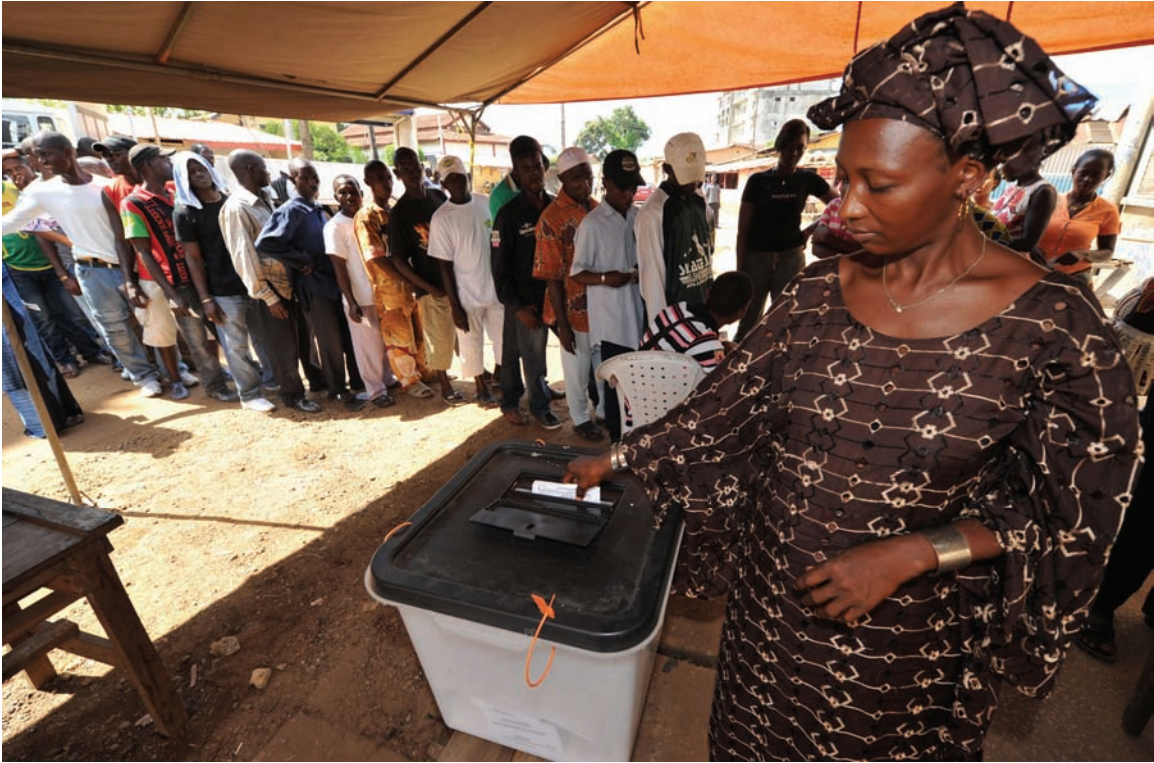
A woman casts her vote at a polling station in Conakry on November 7, 2010.

Corruption within both the public and private sectors in Guinea has long been endemic. From the petty corruption and bribe-solicitation perpetrated by frontline civil servants to the extortion, embezzlement and illicit contract negotiations that take place in the shadows, those involved in bribery and various forms of corruption are rarely investigated, much less held accountable. Guinea's past rulers have also largely mismanaged, embezzled, and squandered the proceeds from the country's abundant natural resources, thereby denying the majority of the population access to even the most basic health care and education. As a result, Guinea is one of the world's poorest countries and suffers some of the world's highest rates of infant and maternal mortality and adult illiteracy, despite its natural resources.