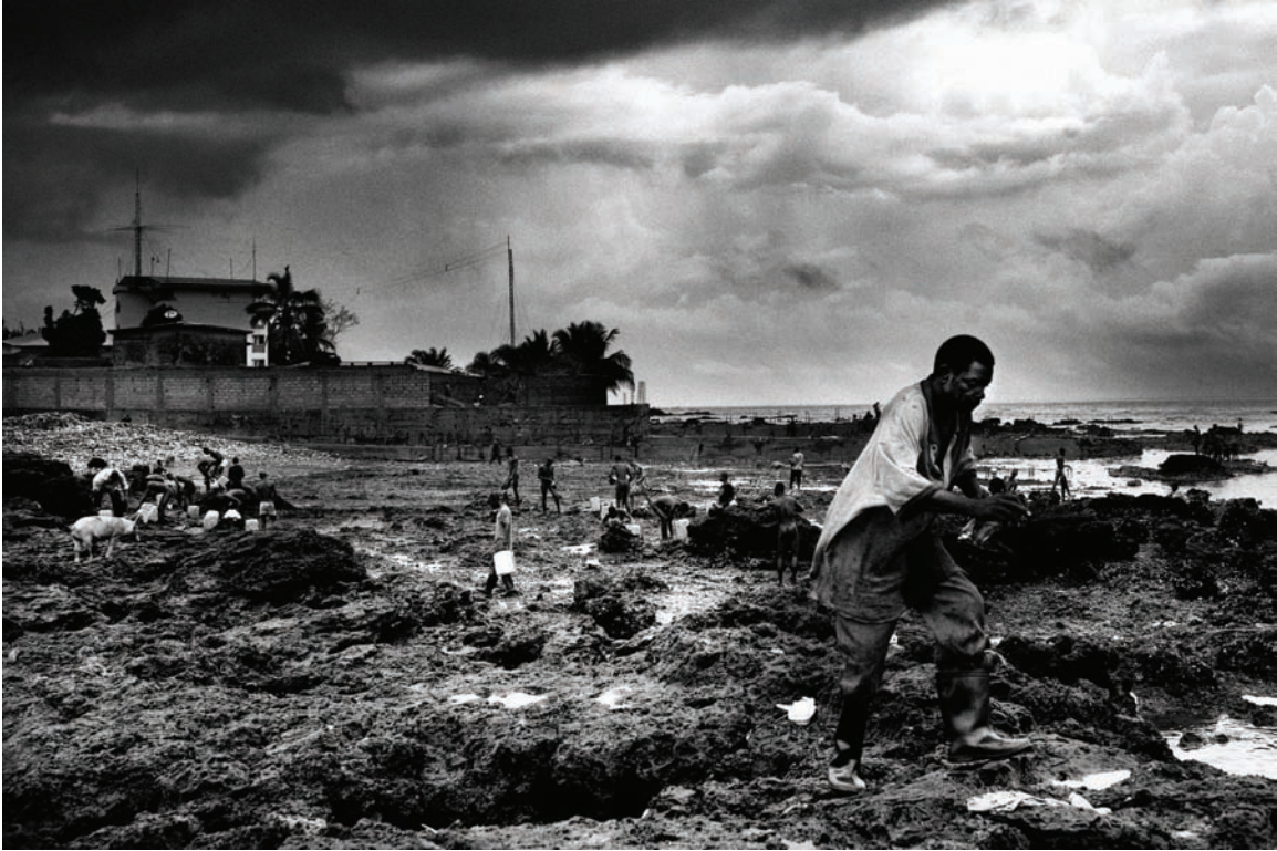
Pigs look for food in a garbage dump behind an abattoir while men wash themselves in the sea. Guinea ranked 156th out of 169 countries on the United Nations Human Development Index in 2010. Conakry, Guinea.

In large part as a result of pressure applied by the diplomatic community and international financial institutions, by 2009 Guinea had established many protocols, procedures, and laws to improve its economic governance. In terms of international protocols, Guinea has signed but not ratified the African Union Convention on Preventing and Combating Corruption and the United Nations Convention against Corruption.