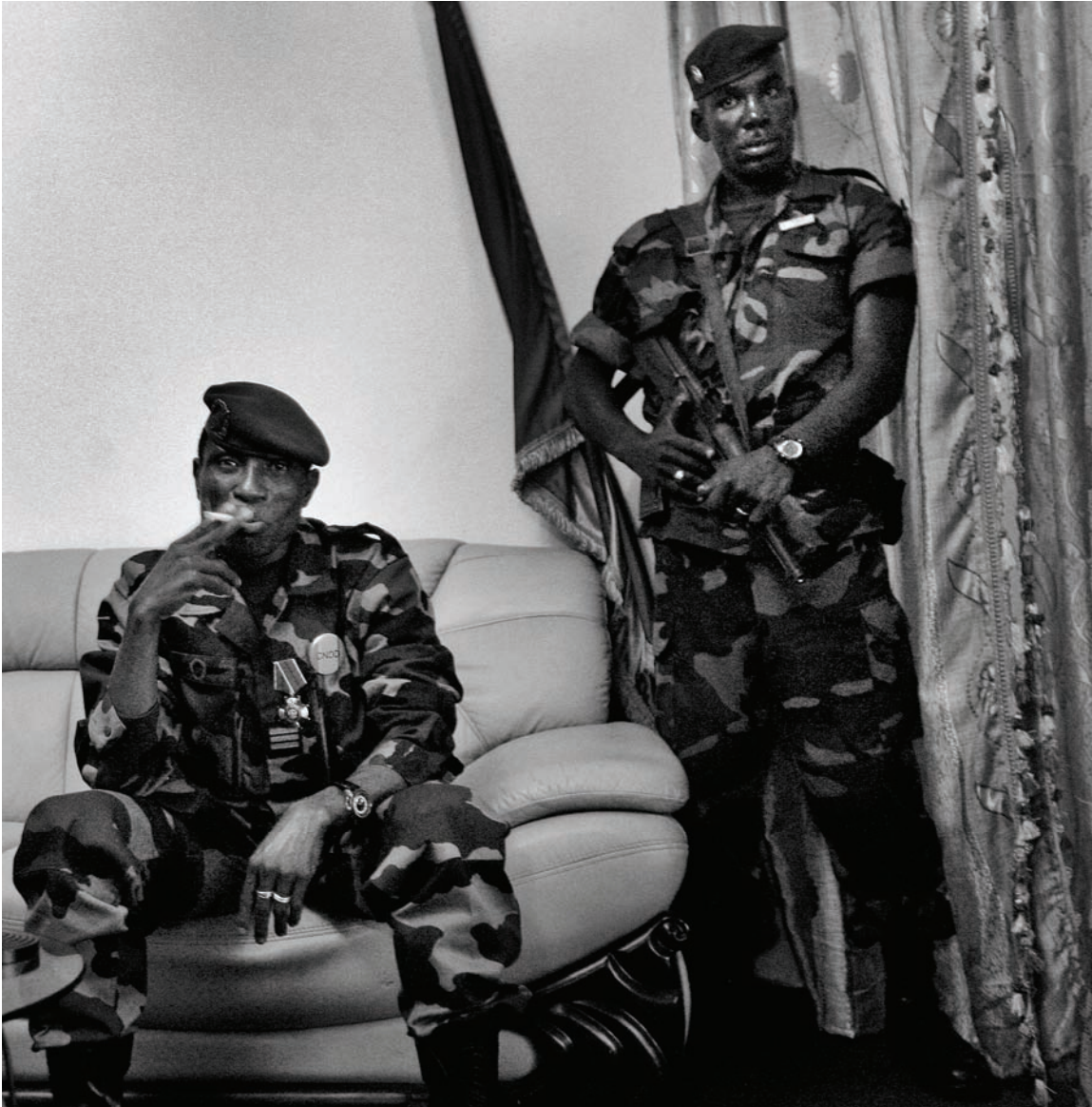
A bloodless coup in the hours after the death of President Conté on December 22, 2008, led by self-proclaimed president Captain Moussa Dadis Camara brought hope for improvement in Guinea's chronic human rights problems, however his one-year rule was characterized by serious abuses, including the bloody September 2009 massacre of some 150 opposition supporters.

Development ( Conseil national pour la démocratie et le développement , CNDD) brought hope for improvement in Guinea's chronic human rights problems. The coup leaders, led by self-proclaimed president Captain Moussa Dadis Camara, pledged to hold elections in 2009 and to root out corruption. 25