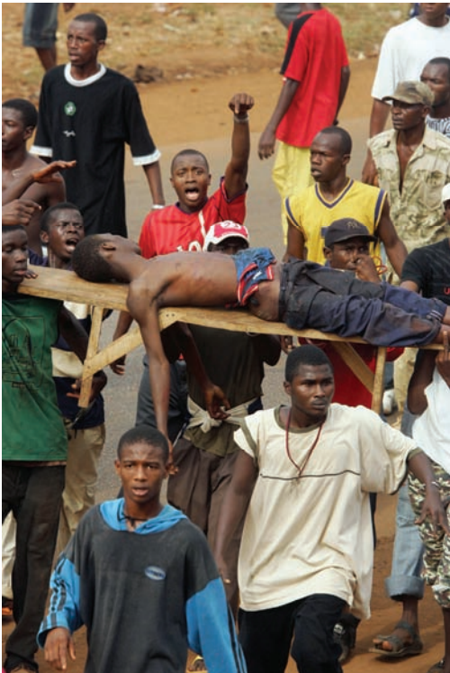
Protesters carry the body of a demonstrator who was killed by security forces during a demonstration on January 22, 2007 in which tens of thousands of Guineans in the capital city of Conakry attempted to march to the National Assembly building. The individual pictured here was one of at least 129 killed by security forces during the January and February, 2007 strike violence.

“command responsibility” enables military commanders and others in positions of authority to be held criminally liable when crimes are committed by forces under their effective command and control, when they should have known about the crimes, and when they fail either to prevent the crimes or prosecute those responsible. Guinea’s current penal codes are not adequately developed with respect to these international and human rights law concepts, presenting an additional judicial challenge for September 2009 accountability trials.