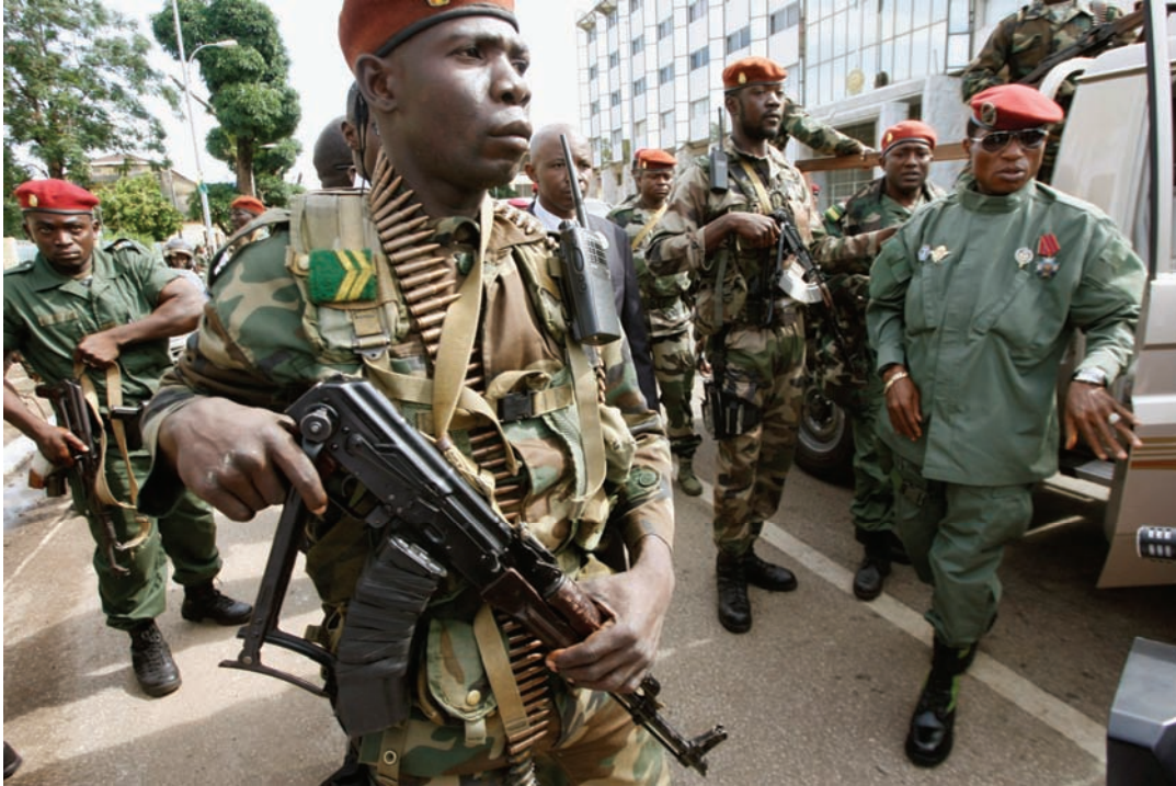
Captain Moussa Dadis Camara, then-chief of the ruling junta, arrives for celebrations commemorating the Republic of Guinea's independence day on October 2, 2009.

There is considerable disagreement among Guinean human rights defenders, victims, and others about whether the Guinean judiciary or the ICC should assume responsibility for investigating and trying those responsible for the September 2009 crimes. Guinea ratified the Rome Statute, the ICC's founding treaty, on July 14, 2003. As such, the ICC has jurisdiction over war crimes, crimes against humanity or genocide possibly committed in Guinea or by nationals of Guinea, including killings of civilians and sexual violence. 48 However, it is a court of last resort; under the principle of complementarity, it intervenes only when national jurisdictions are unwilling or unable to investigate or prosecute such crimes. 49