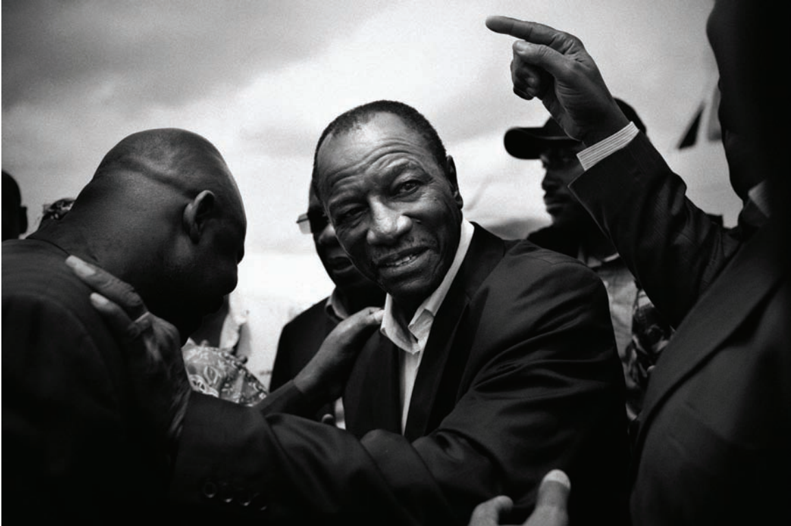
To sustain the momentum generated by the elections and fulfill the expectations of Guineans, Guinea's new president, Alpha Condé, must take decisive steps to address the profound human rights and governance problems he has inherited.

After the medical evacuation of Dadis Camara from Guinea, the more moderate General Sékouba Konaté, then-Vice President and Minister of Defense, assumed power and began to bridge the increasingly volatile cleavages along ethnic, generational, and political lines within the army. Over the next 11 months, Guinean actors—including General Konaté and other members of the military and civil society who were determined to freely and fairly elect their leaders—ushered in, with the support of the international community, the political process leading to the presidential election of November 2010.