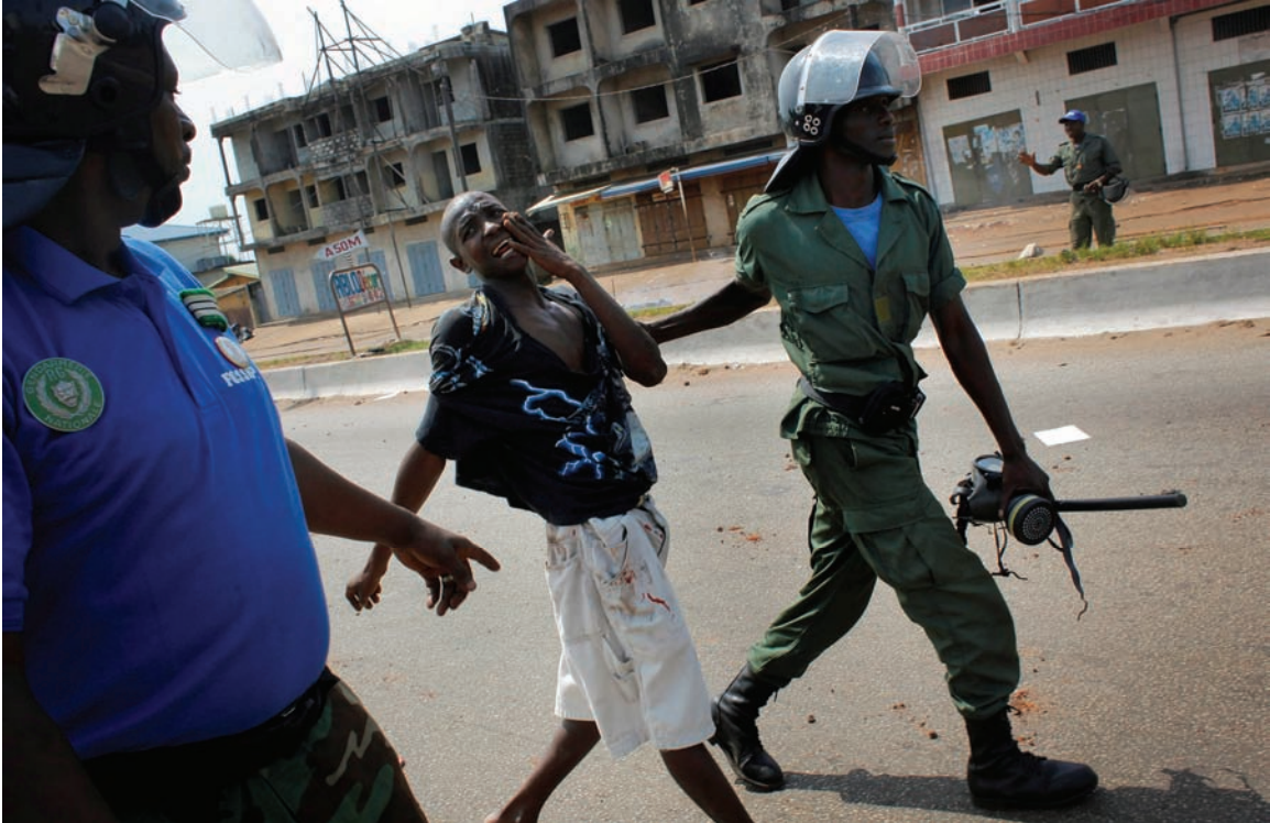
Guinean police detain a supporter of UFDG presidential candidate Cellou Dalein Diallo during an episode of election-related violence in Conakry, Guinea, Monday November 15, 2010.

Human Rights Watch urges the new government to ensure independence from the presidency in making the commission operational, including in appointments and financing, in compliance with the Paris Principles and best practices of human rights commissions. The creation of a strong, independent, and sufficiently-financed and impartial body can play a meaningful role in helping develop a culture of respect for human rights and the rule of law in Guinea.