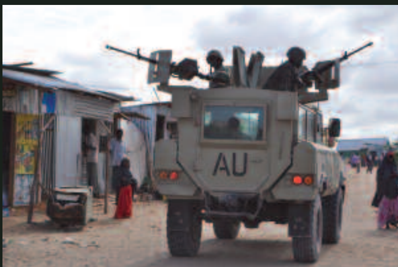
AMISOM troops patrolling the Zona-K camp for displaced people in Mogadishu's Hodan district in June 2012.

Human Rights Watch urges troop-contributing countries to appropriately punish perpetrators and ensure survivors are adequately supported. It calls on the AU and AMISOM to foster an organizational culture of “zero tolerance” of unlawful activities on their bases. International donors should closely monitor AMISOM and take action when AMISOM forces are committing sexual exploitation and abuse and when the relevant authorities have failed to take the necessary corrective measures.